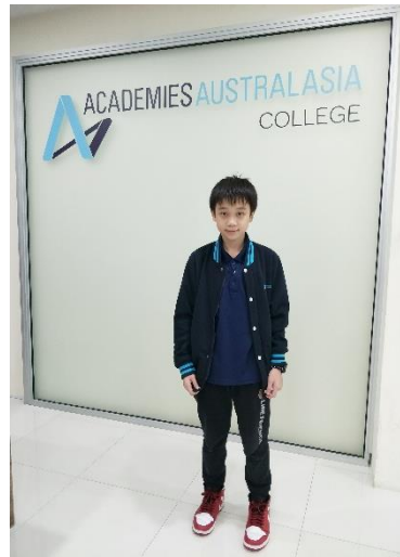
An example of a neat and correct way of a student's dress code in AAC