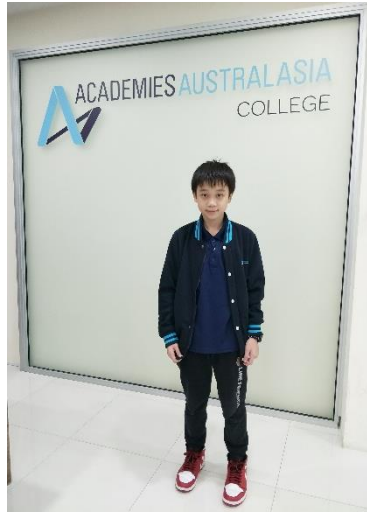
An example of a neat and correct way of a student's dress code in AAC