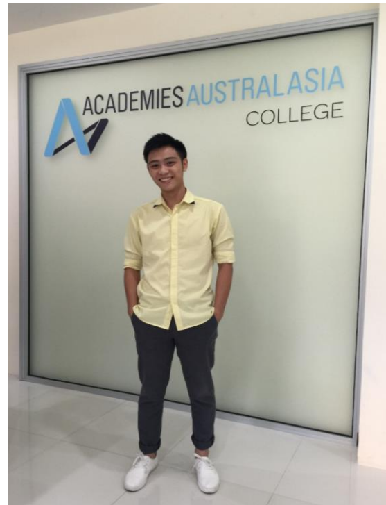
An example of a neat and correct way of a student's dress code in AAC